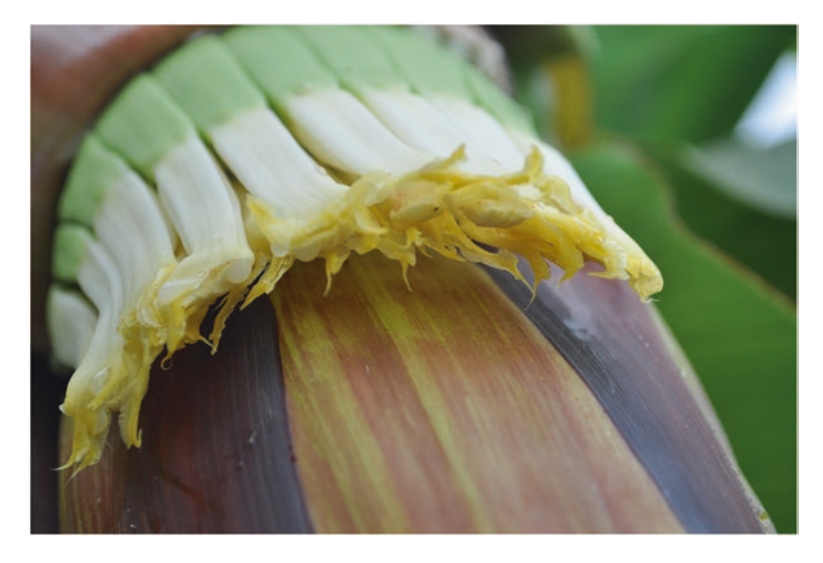
Fig. 7.2 Male banana flowers open in the evening and are ready for pollination early in the morning