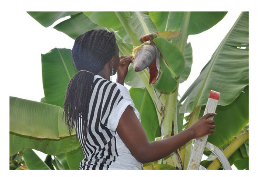
Fig. 7.3 Bract is pulled back and pollen applied directly to the receptive female flowers

Bunches are harvested prior to physiological maturity, generally when the first signs of yellow color are observed in the distal fingers. Bunches are left to ripen in protected sheds, and seeds are extracted and surface-sterilized for embryo culture to avoid seed/embryo desiccation. Embryos are extracted from dissected seeds under aseptic conditions and cultured on artificial culture media (Bakry et al. 2009; Uma et al. 2011). Longitudinal excisions are made on the seed to expose the embryo