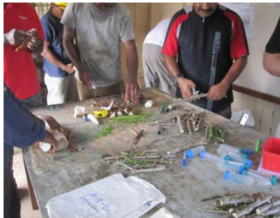
Below: All parts of the cassava plants (stems, roots and leaves) from the field trial were harvested for biomass calculations.

Furthermore, an integral part of the study was also to use data generated to build the cassava Agricultural Production Systems Simulator (APSIM) model by collaborators at CSIRO, Australia.