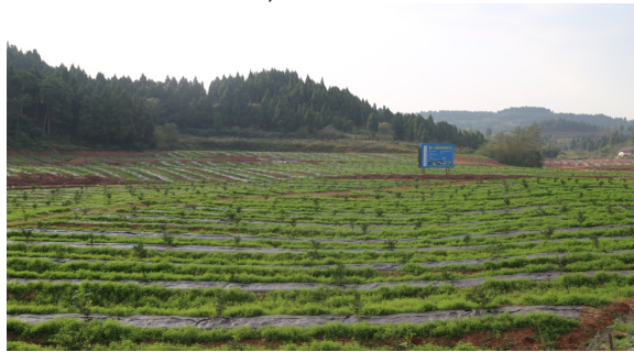
Figure 1. Intercropping with L. cicera to improve fruit quality of orange orchards in Jialing district, Sichuan province, China

Intercropping green manure in orchards is an important measure of modern orchard management and a soil management tool to realize sustainable development of the fruit industry. Using L. sativus and L. cicera as green manure has been promoted and applied in large areas of peach and plum orchards in Nanchong, Guang'an, Suining, Meishan and other citrus producing areas, with a cumulative promotion area of more than 200,000 hectares.