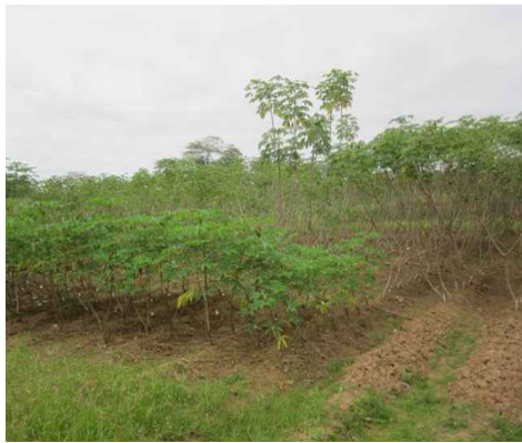
Above: Cassava growing in the field trial at Koronivia, near Suva, Fiji.

trials were conducted with plots established at the onset of the dry and wet season, six and twelve months into the main trial, and harvested in the same way. There were five main findings: (1) time of planting and harvesting were important in terms of yield and nutritional value; (2) Nadelei contained more cyanide in the leaves than the Merelesita variety but this difference was not observed in the tubers; (3) Nadelei yielded more than Merelesita but only when planted in the wet season; (4) cyanide concentration was higher in the leaves harvested during the dry season; and (5) genetic sequencing showed that the two varieties were distinct but the branched and unbranched forms of Nadelei were genetically the same.