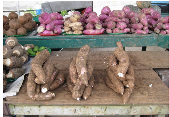
Street stall in Suva, Fiji with sweet potatoes, cassava, taro and coconuts. Cassava is an increasingly important staple food in the region.